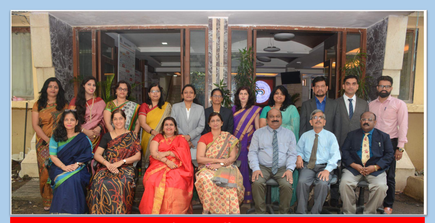
Teaching Staff, BVIMSR