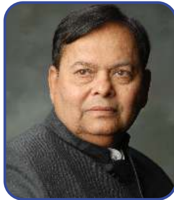
Dr. Patangrao Kadam

Bharati Vidyapeeth (Deemed to be University)